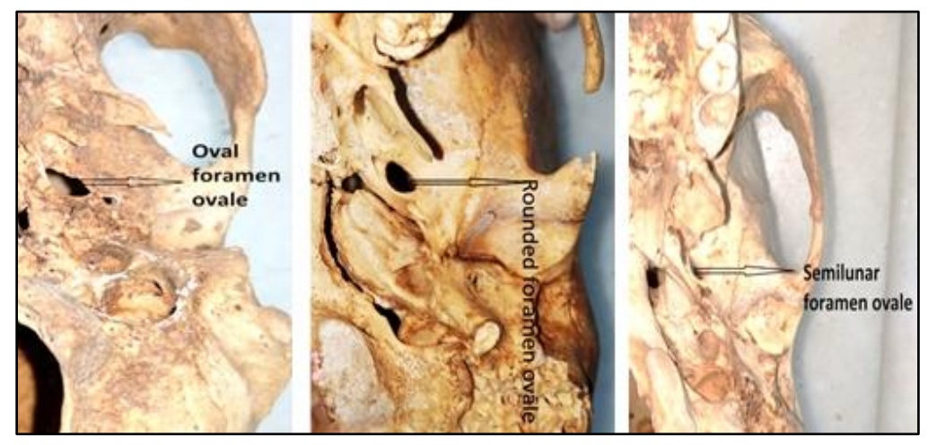
Fig-1: Different shapes of Foramen ovale

The mean anteroposterior diameters (APD) of the right and left foramen spinosum were 3.14 mm and 3.05mm. The mean transverse diameters (TD) of both the right and left foramen spinosum were 2.68mm and 2.58mm respectively (table-2). Various shapes of foramen ovale and spinosum were observed (fig 1, 2). These observations are given in table no. 3 and 4. Two rare variations were also observed. A skull with elongated upper end of lateral pterygoid plate overlapping foramen ovale was found converting it into doubled foramina. Another skull was having bony spur over Foramen spinosum.